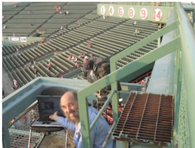
Figure 1. A laptop Random Number Generator (RNG)

The RNG device generates approximately one million bits (ones or zeroes) per second, which are processed by the software's bias-enhancing algorithm into ten clustered subunits per second. For the purpose of rendering the graphical representation shown in Figure 2, two plots whose time-averaged